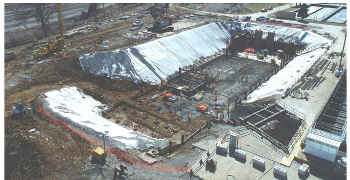
Solids processing building basement construction, Lemay