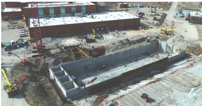
Solids Processing Building basement foundation, Bissell