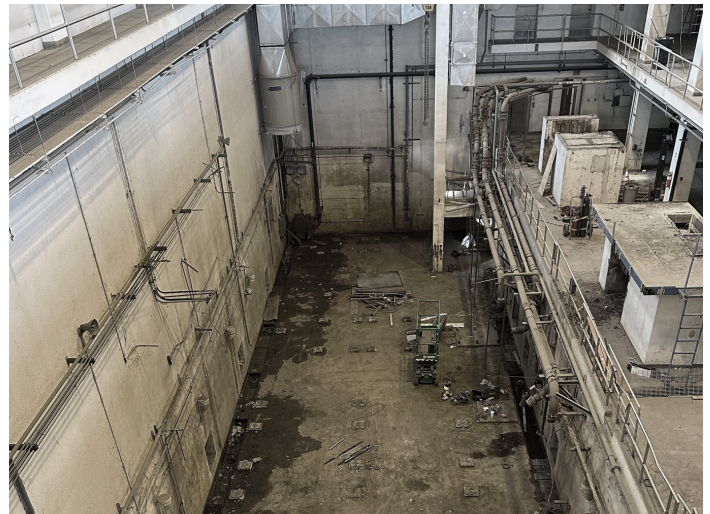
Progress at the Grit & Screen Building, Lemay